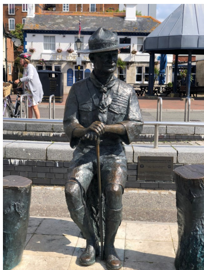
“Rest” day for BrightStar crew